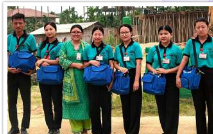
Rural community exposure