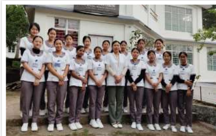
State Mental Health Institute Kohima