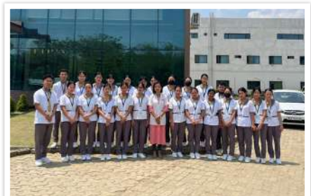
Olive Christian Hospital & Research Centre