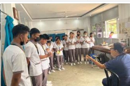
Nikos Hospital and Research Centre