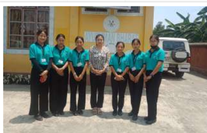
UPHC Burma camp