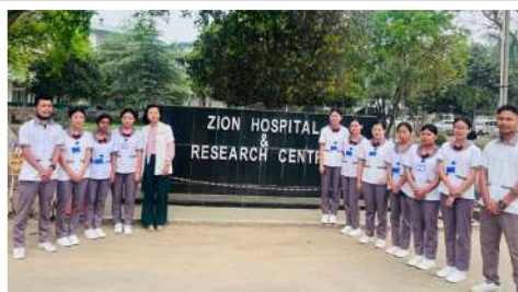
Zion Hospital &amp; Research Centre